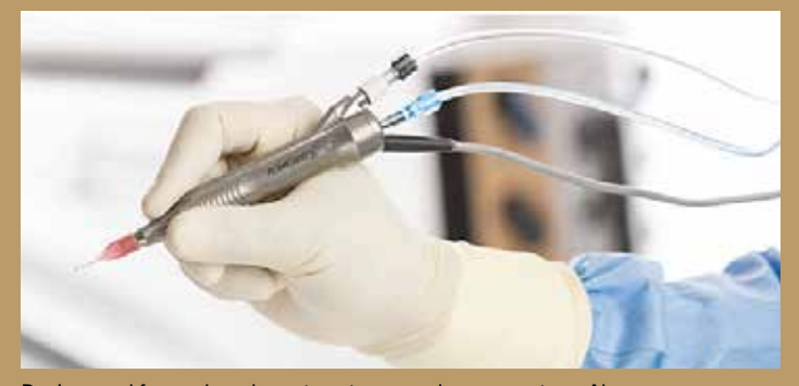
Device used for modern day cataract surgery.